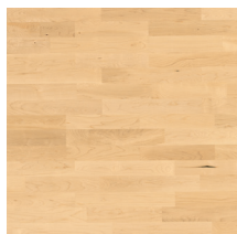
Pure Maple Nature TreS