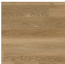
Pure Oak Nature Plank