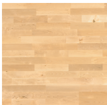
Pure Birch TreS