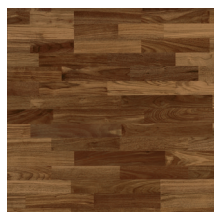
Pure Walnut TreS

The pictures only present the colour of the floor. For more details regarding grading and variations see the Grading Book or www.tarkett.com . Tarkett's international range of floors comprises many different products. Some of these may not be for sale in your country. Although every care has been taken to reproduce images that reflect the finished product, the quality of monitor and printer and the nature of wood results in variations in the color and structure of individual planks.