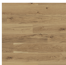
Pure Oak Rustic Plank XT