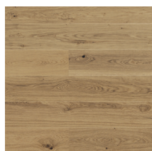
Pure Oak Rustic Plank