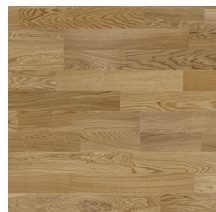
Pure Oak Nature DuoPlank