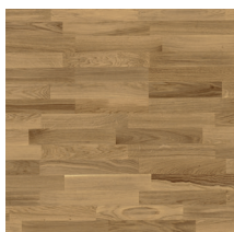
Pure Oak Nature TreS