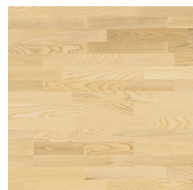
Pure Ash Nature TreS