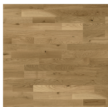
Pure Oak Rustic TreS