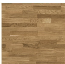
Pure Oak Nature TreS (brushed)