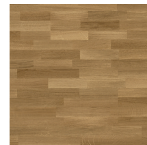
Pure Oak Select TreS