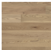
Pure Oak Antique Plank