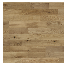
Pure Oak Rustic DuoPlank